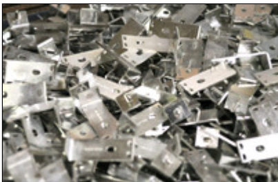
Aluminum Bus Bar Amperes for 6101-T61 Alloy 57% IACS Conductivity Chart Below